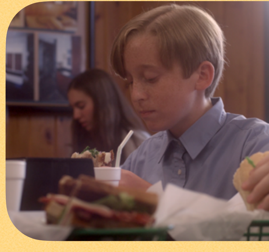
A bizarre rite of passage at the local deli determines the fate of a generation of teenagers, leadings some to escape their suburban town and dooming others to remain...